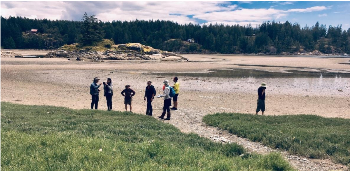
At Manson's Lagoon – socially distanced.

CIMAS generates income through memberships, donations, the Museum Shop, community programming, and Misty Isles Historic Cruises. In 2020, as a result of COVID-19, visitor numbers were reduced by nearly 70% and most in-person programming was cancelled. Hosting online programming events did not generate equivalent levels of donations, and only two Misty Isles cruises were held. To support Misty Isles Adventures, CIMAS did not collect commissions from these trips. As a result of all these changes, our fundraising income was significantly reduced.