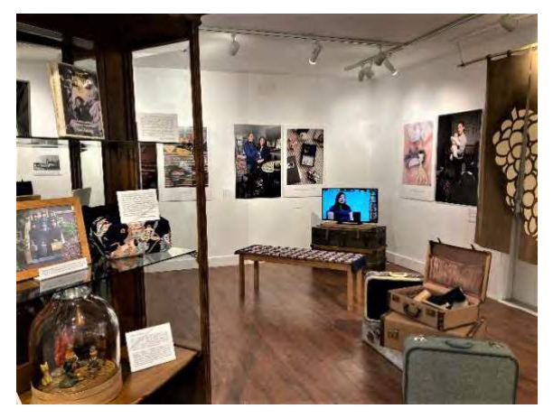
The Suitcase Project Exhibition