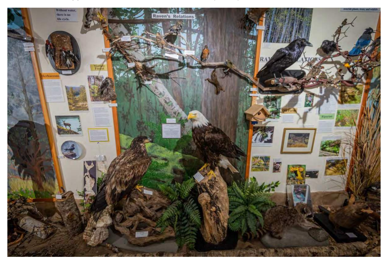
Wild Cortes - Photo credits Tayu Hayward/BC Museum Portraits, 2022

Von Donop Logger's Workshop – Photo credits Tayu Hayward/BC Museum Portraits, 2022